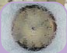
Pilkington Oriel Coppice ™