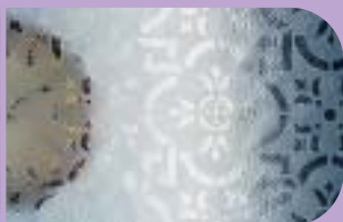
Pilkington Oriel Texture Canterbury ™