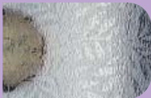
Pilkington Oriel Texture Laurel ™