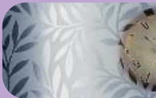
Pilkington Oriel Laurel ™