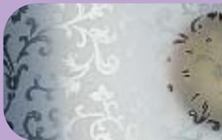
Pilkington Oriel Brocade ™

With a superb range of designs, together with diffused glass options for each design, this premium range of etched glass adds a touch of style and elegance to your home.