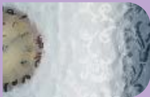
Pilkington Oriel Texture Brocade ™